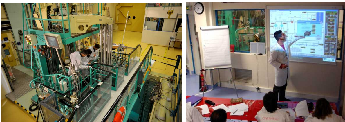
Fig 2. Photos of: a - Reactor hall during ISIS presentation to the trainees, b- Control room

Figure 2-a shows a photo of the top of pool in the reactor hall, during the reactor presentation to students. The vertical metallic tubes in the middle of the picture are the mechanisms of the control rod. Figure 2-b shows the inside of the control room where the parameters of the reactor can be followed on a supervision screen in front of the participants.