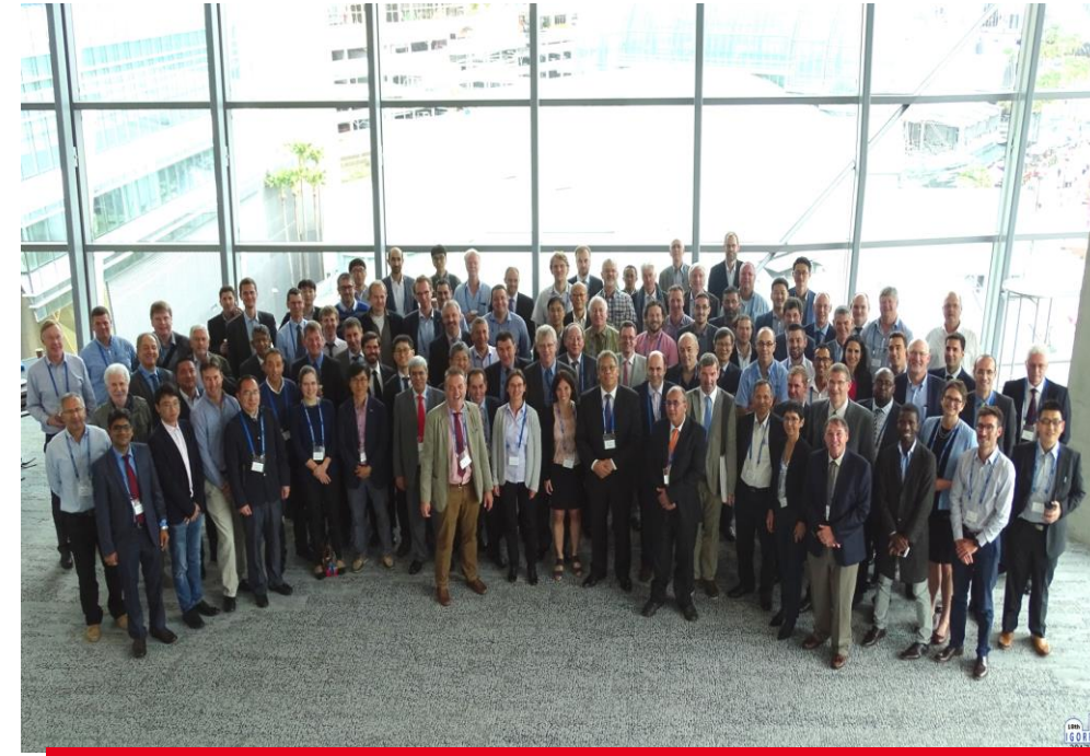
IGORR Conference Dec 2017 Sydney